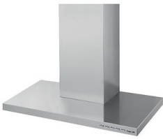
Hood KS Lux 2504 094