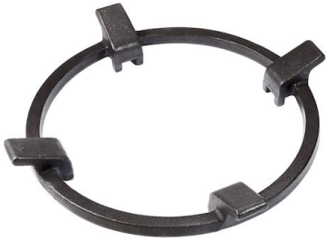
Cast iron wok support 9601 727